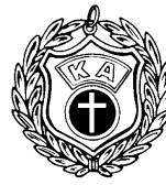
Graduate Charm Coat of Arms